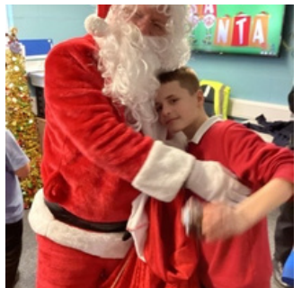
Working off that Christmas lunch!